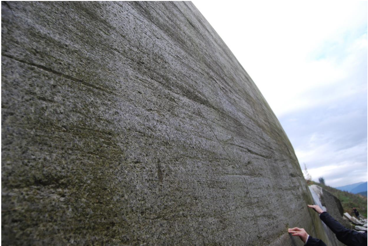
Figure 2. Participants using touch to deduce direction of motion from glacial striations at Stawamus Chief.