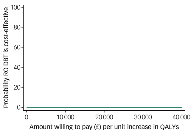
Fig. 2 Cost-effectiveness acceptability curve for quality-adjusted life years (QALYs) showing the probability that radically open dialectical behaviour therapy (RO DBT) is cost-effective compared with treatment as usual after 12 months from the perspective of the National Health Service and personal social services.

Since our results suggest that RO DBT in its current form is not cost-effective relative to TAU according to NICE criteria, research should address how to refine RO DBT to maintain the present gains but at lower cost for longer. There are many ways of adjusting the delivery of RO DBT to reduce costs, and future work must address the effectiveness and cost-effectiveness of these amended manuals. For example, we could taper treatment by reducing the frequency of sessions after an initial intensive period or adopt a stepped approach offering group sessions initially and individual sessions only to those who fail to respond. Indeed, small studies of RO DBT skills training classes have reported promising improvements in