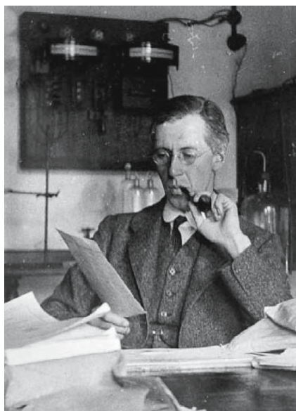
Figure 1. A photograph of Henry Dale taken in 1918 at the Lister Institute for Preventive Medicine.