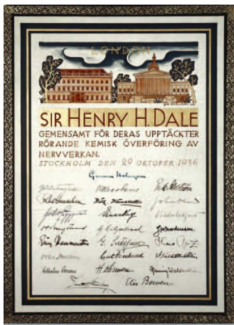
Figure 3. The Nobel Prize certificate awarded to Henry Dale in 1936.