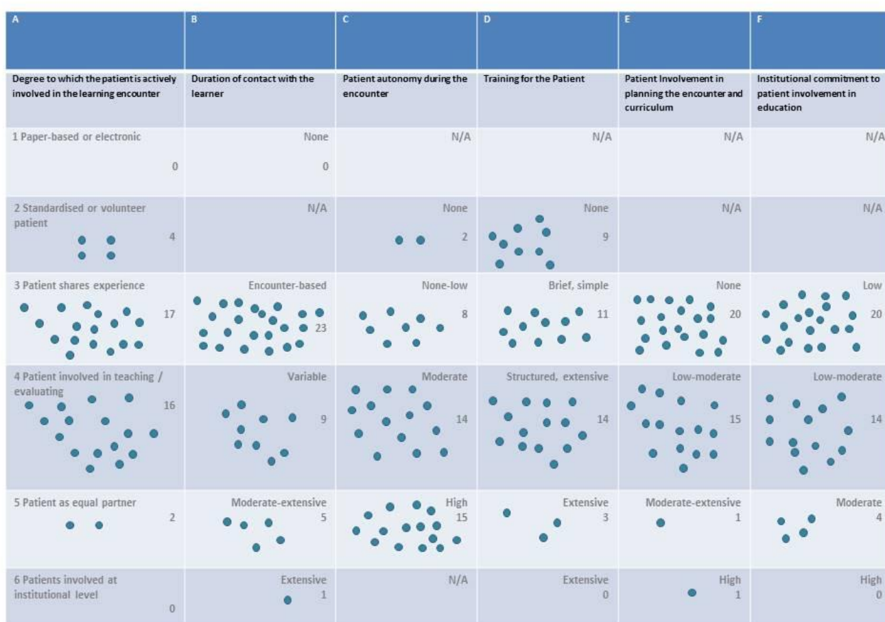
Figure 2: Studies mapped to each of the six domains and six levels of the Towle Taxonomy of involvement. ● = 1 study. This indicates the range of the depth of involvement of the patient / service user, from a passive participant sharing their experiences in a faculty-led encounter to a fully integrated member of the curriculum-planning faculty, with autonomy for planning and delivery.

Figure 2 shows the categorisation of the individual studies according to Towle’s framework, mapping to the six domains and ranging across the 6 levels of this taxonomy, thus demonstrating how the current literature reflects the range of the depth and impact of patient / service user involvement in medical education. Our exclusion criteria specifically removed all level 1 studies and so none were included.