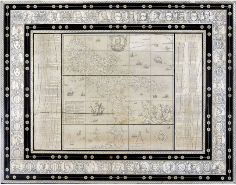
1. Interior side of an inlaid cabinet dating to 1619 showing the Adriatic Sea surrounded by cameos of kings of Spain and Naples; the external face shows a map of the globe. The cabinet, produced in the circles of the Viceroy of Naples, was part of a series and is now held at the Certosa e Museo di San Martino.

Diplomatic dispatches and petitions show that Ottoman authorities and merchants kept a close eye on the events. In the months before the battle they demanded redress from the Venetians for the losses incurred as a result of earlier Spanish attacks. The sultan sent an envoy to Venice, which he held responsible for failing to protect the Adriatic. 102 After the battle, diplomatic dispatches show that the Ragusan and Venetian envoys engaged in fierce discussions in Istanbul. The former, subjects of the sultan, complained of