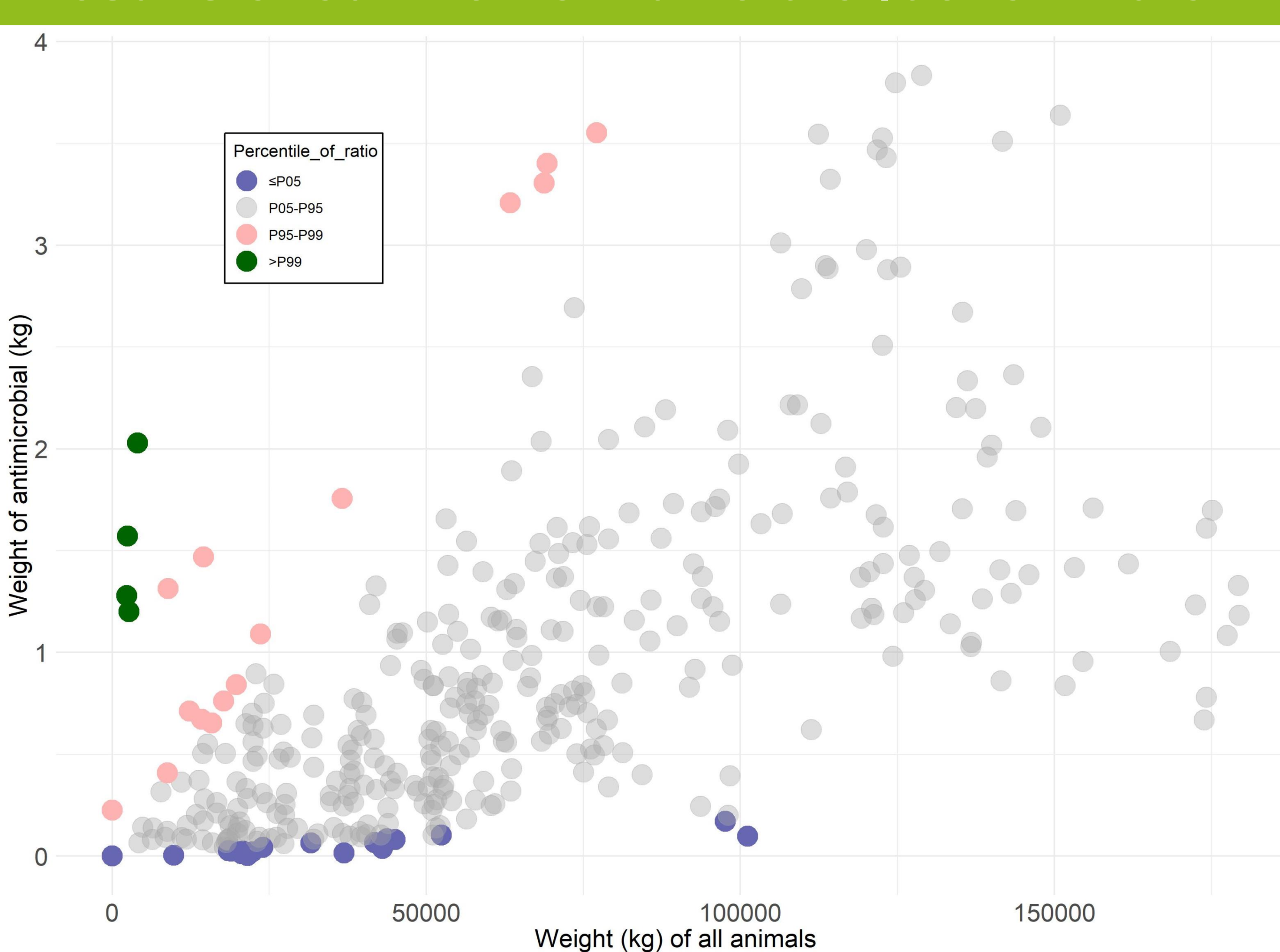
Fig 1. Total weight (kg) of active ingredient (a.i.) of antimicrobial sold and total weight of animal for each herd-year. Colours indicate the percentile range in which the ratio for each point belongs.