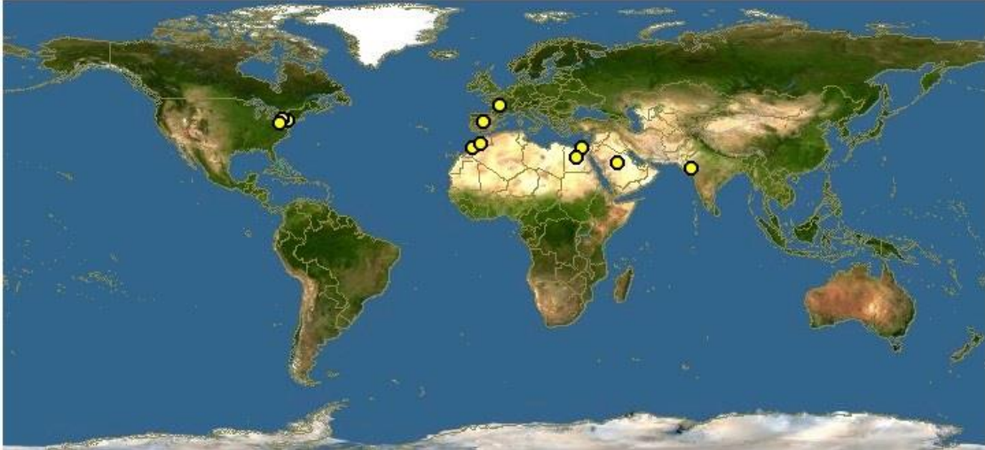
Distribution of Coelioxys coturnix .