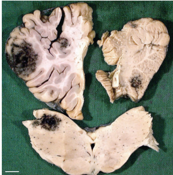
FIG 1: Coronal sections of the cerebrum (top left) and midbrain (bottom), both anterior views, and a sagittal section of the cerebellar vermis (top right) of a northern bottlenose whale ( Hyperoodon ampullatus ). There are roughly circular, poorly circumscribed areas of haemorrhage (black) in all three sections. Bar=1 cm

The carcass was transported to Scottish Agricultural College Veterinary Services, Inverness, where postmortem examination was performed by a modification of a recognised protocol for cetaceans (Kuiken and Hartmann 1991). Samples of lung, liver, spleen, kidney, forebrain and mesenteric lymph node, and blood and swabs from the small and large intestine, rectum, and bronchial pus were stored at 4°C overnight before routine microbiological examination, as described previously by Dagleish and others (2006). Samples for histological examination (lung, liver, spleen, adrenal glands, kidney, urinary bladder, mesenteric lymph node, and skin from the flank and tail fluke) were fixed in