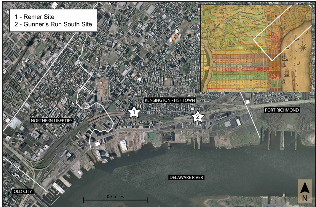
Figure 1. Aerial view of I-95/GIR project area in Philadelphia, Pennsylvania with sites discussed in this article marked. Interstate 95 runs across the image, following the Delaware River at bottom. The white box outlines the project area. (Inset map, Varle [1802]; base map ArcGIS® World Imagery [copyright © Esri, all rights reserved], map by Thomas J. Kutys, 2017.)

along the Delaware River waterfront. Kensington quickly became an important fishing and shipbuilding center. To the north and west, beyond Kensington, the land remained a place favored by wealthy Philadelphia families for the building of luxurious mansions and summer retreats. Throughout the 18th century the project area remained sparsely settled, with development focused on the shipbuilding and fishing industries concentrated along Richmond Street, a major thoroughfare. By the late 18th century, industries, such as glass and steel manufacture, sprang up around Gunner's Run and the Delaware River. Gunner's Run is a stream, now culverted, that emptied into the Delaware River in northern Kensington.