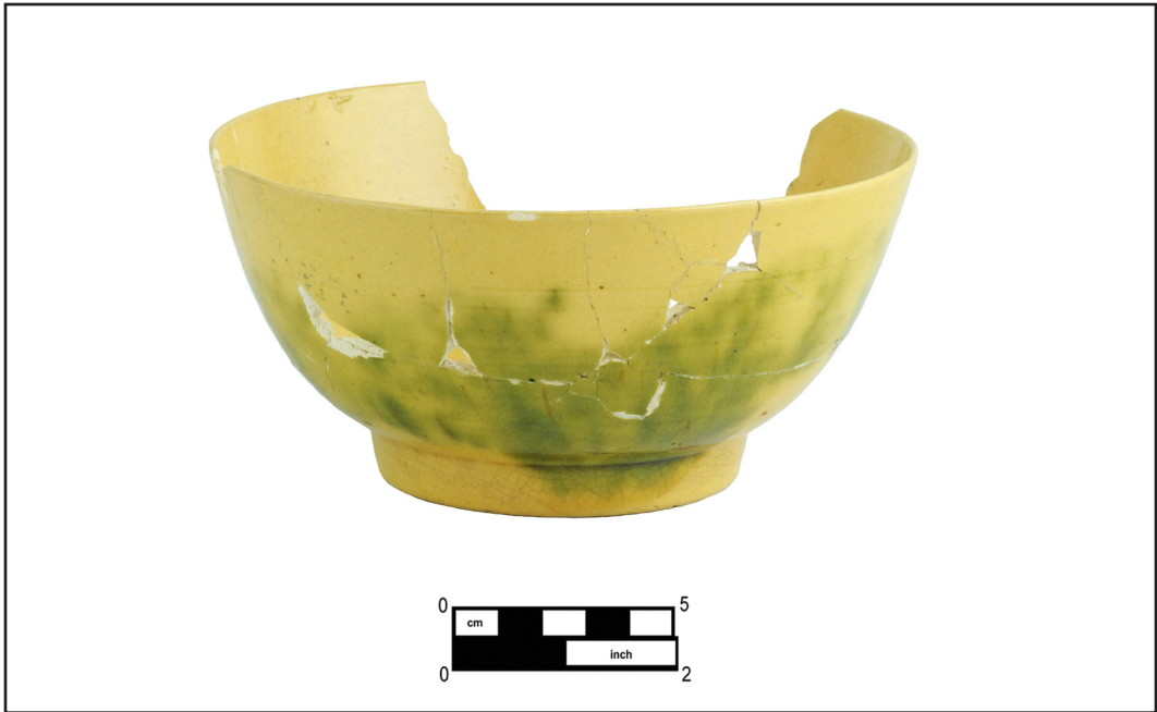
Figure 3. Chinese/Common-shape queensware bowl with green copper oxide decoration from Feature 6 at the Remer Site.