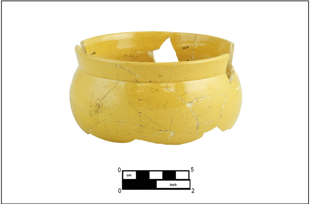
Figure 8. Queensware porringer from Feature 476 at the Gunner's Run South Site.