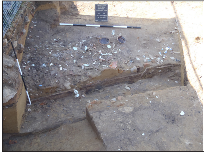
Figure 5. In progress plan view of Feature 386 at the Gunner's Run South Site.

After the Civil War, the area became more industrialized, and the demographics of the block changed. When the fire department was professionalized, the Kensington Hose Company house was replaced by the Sykes & Son Nut and Bolt Works, and what remained of the Bennett land was subdivided to build row homes for workers, as more of the inhabitants were being employed in factories, iron foundries, shipyards, and mills (PDR 1855; PDR 1873; PDR 1876; Hopkins 1875; Costa 1870: 850; Costa 1875: 156, 389, 715, 1240, 1438; Costa 1876: 157, 329, 715, 1243, 1442; Costa 1877: 323, 550, 691, 1251, 1352, 1390-1391; Costa 1878: 337, 734, 1232, 1500-1501; Costa 1879: 95, 376, 779, 1261, 1504; Costa 1880: 95, 396-397, 823, 1320, 1469, 1567; James Gopsill 1884: 262, 408, 790, 1233, 1556, 1573, 1713; JGS 1889: 157, 278, 286, 378, 526, 613, 1257, 1285). The houses and remaining buildings along Richmond Street were