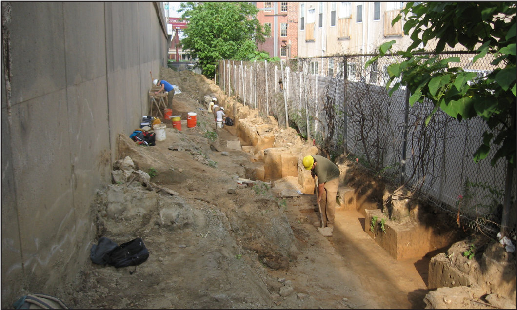
Figure 2. Archaeological excavation in progress at the Remer Site.

brick-lined privies across eight city blocks, providing data on a cross section of domestic life along the waterfront. These artifact assemblages offer valuable insights into the lives of the 19th century occupants of the Northern Liberties, Kensington, and Port Richmond neighborhoods. As analysis proceeds, it is clear that many of the artifacts recovered are directly related to the occupations of the residents. Most of the artifacts have been found in privies just west of the glass factories, in neighborhoods where glassworkers, fishermen, and shipwrights resided. Households were often crowded, with multi-generational or multiple families, plus numerous children and transient renters (AECOM 2018).