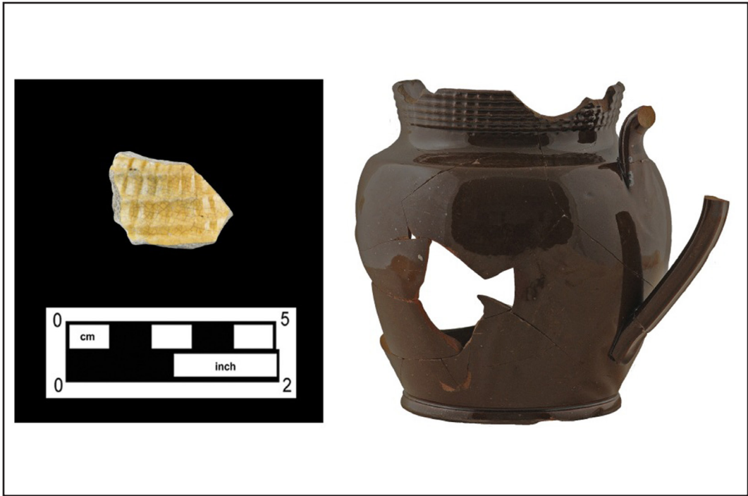
Figure 10. Rouletted queensware sherd from Feature 93 at the Gunner's Run South Site, shown with a redware teapot with similar collar rouletting recovered from the Remer Site.

makes the vessel stand out among the other domestic queensware examples. To date, none of the newspaper advertisements for domestic queensware mention porringers, although it is possible that this common form was included under the term "etcetera," which was frequently used in the advertisements.