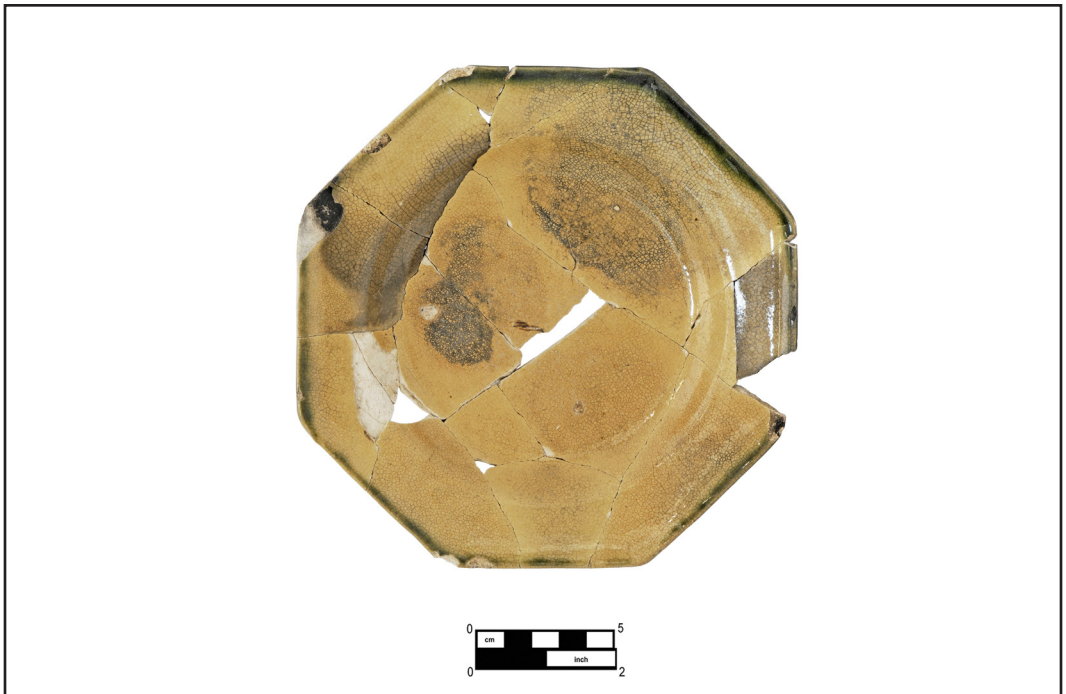
Figure 9. Octagonal queensware plate with green copper oxide rim decoration from Feature 93 at the Gunner's Run South Site.