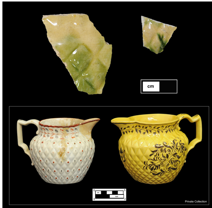
Figure 7. Diamond pattern hollowware sherds from the Gunner's Run South Site (left from Feature 386 and right from Feature 674); contemporary pearlware and English yellow-glazed vessels (both from a private collection) shown for comparison.