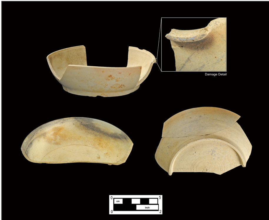
Figure 4. Three biscuit queensware saucers from Feature 1 at the Remer Site, including a detail of rim damage on one.