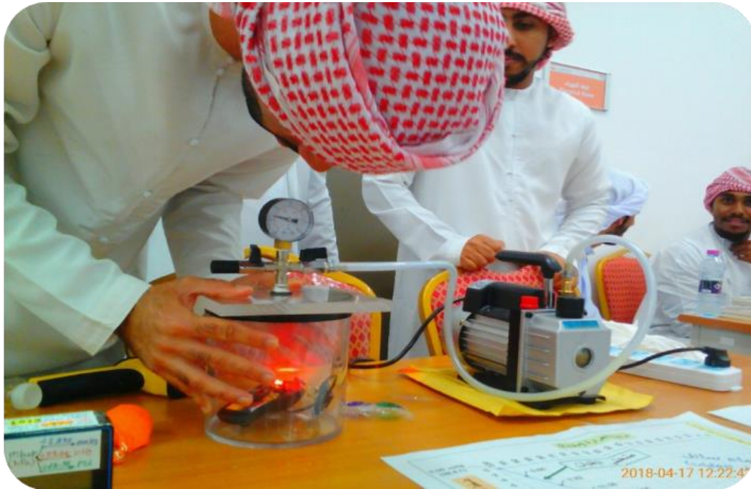
Figure 8. The sound wave propagation experiment