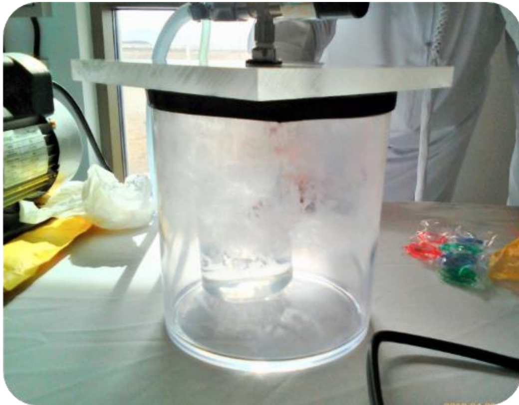
Figure 6. Cold boiling inside one of our chambers