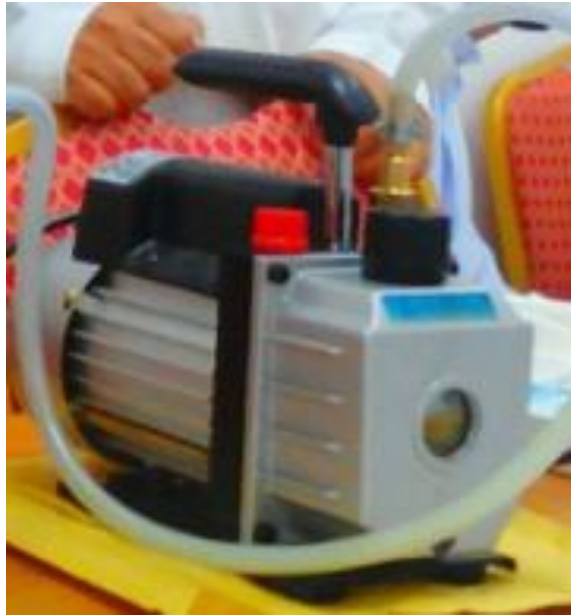
Figure 4. A benchmarking rotary-vane vacuum pump

The comparison focuses on assessing which vacuum machine reaches a vacuum of 25 inches of mercury (inHg) faster while evacuating a 2-liter cylindrical chamber. The benchmarking test was repeated three times and the results see consistency as given in Table 1 as times elapsed to reach the set vacuum level in seconds.