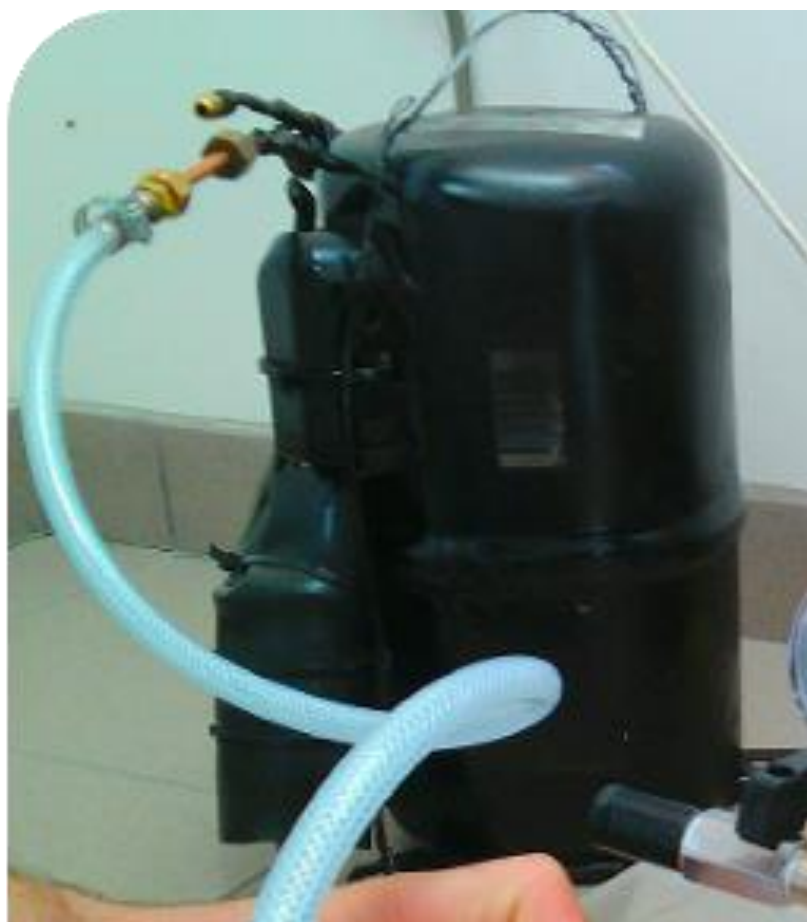
Figure 2. The compressor used in our work, before assembling it within the vacuum generator