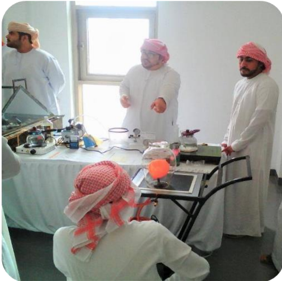
Figure 7. The balloon expansion experiment