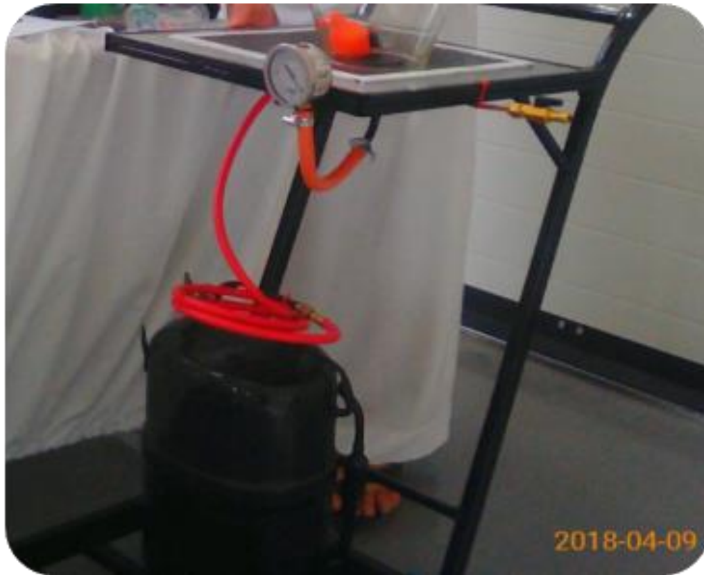
Figure 3. The compressor used in our work, after assembling it within the vacuum generator

For the vacuum chamber, we decided to use ready glass containers (large vases) in the market. To use the chamber, it should be flipped upside down such that its rim rests on a horizontal gasket. The rim surrounds a suction port connected to the inverted compressor. This achieves sealing that increases as evacuation progresses. It also allows flexibility with installing chambers since any gas-tight container with an opening that can rest on the gasket can be used as a chamber without any customization. The gasket has a square shape with a side length of 26 cm. It was made from the tube of a car tire.