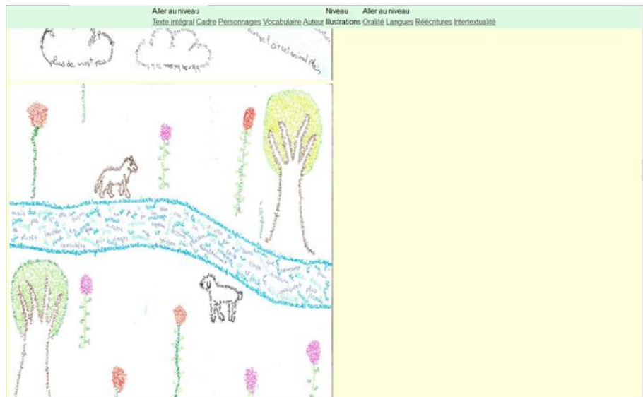
Figure 2. eZB Screenshot of an illustration of the Fable

Beyond the reading, grammar and vocabulary objectives, the project allowed students to participate in the illustration of the fable (illustration 2) and the rewriting of a fable and to become aware of all the possibilities in rewriting, including the creation of a new version of the story where the meaning of the original text is purposely inverted.