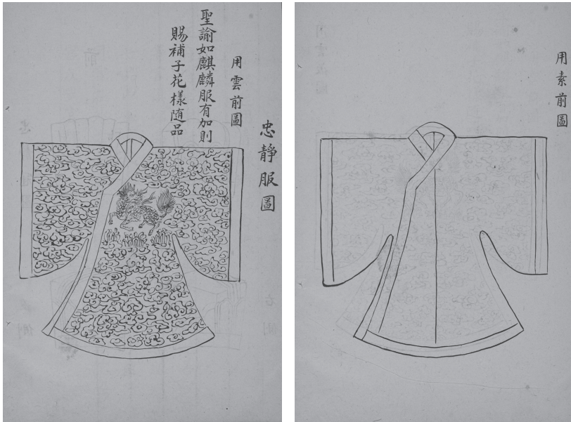
Figure 16.1 Illustrations of the robes of 'Loyalty and Tranquillity'. Left: cloud-patterned robe of officials of the third rank and above. Right: plain robe of officials of the fourth rank and below. After Li Dongyang (1447–1516) and Shen Shixing (1535–1614), Da Ming huidian [Collected Statues of the Ming Dynasty] (Beijing: Neifu kanben, 1587), vol. 24, juan 61, 215b–216a.

the ridges and sides are edged in gold thread. 23 Although made from black velvet rather than the prescribed black gauze, the existence of such an object in the tomb of a Wanli-era (1572–1620) official implies that the Jiajing emperor's blueprint for leisurewear was successfully implemented. The hat became so popular that in 1574, the second year of the Wanli emperor's reign, the government banned all non-officials, such as candidates holding the provincial-level degree ( juren ), students of the Imperial Academy ( jiansheng ), Confucian scholars ( shengru ), and commoners and servants, from wearing it. 24 Consistent with the aims of