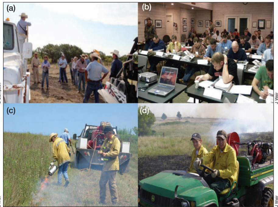
Figure 1. Private citizens are organizing into prescribed burn cooperatives to combat woody plant encroachment in the Great Plains. (a) Members of burn cooperatives pool money and resources, (b) organize training opportunities and workshops, and (c) conduct prescribed burns on each other's properties, while (d) teaching upcoming generations of land stewards the value of fire in grassland conservation.

fire. Moreover, climate warming and intensifying droughts in the growing season have the potential to increase the competitive advantage of juniper over other species (Twidwell et al. 2013b; Volder et al. 2013) and may reinforce juniper dominance even during times of high drought-induced tree mortality (Twidwell et al. 2013b). As a result of these feedbacks, woody encroachment has emerged as the dominant threat to grassland ecosystem services in the Great Plains biome (Engle et al. 2008).