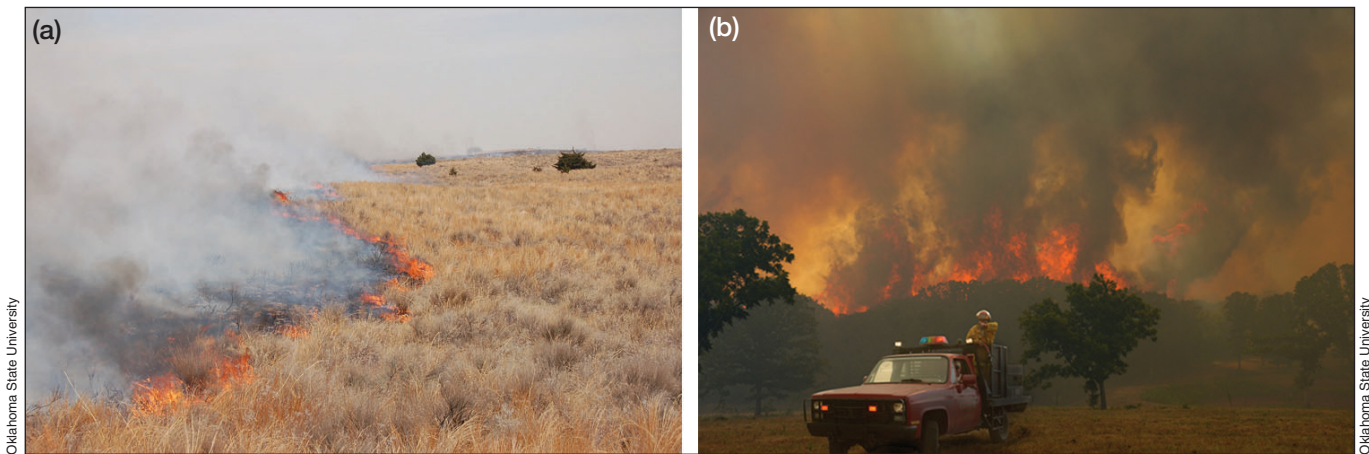
Figure 3. The reduced ability of firefighters to suppress wildfires is an environmental service that has been lost throughout much of the Great Plains. (a) The low-intensity fires frequently observed in tallgrass prairie compared to (b) the tall flames and higher fire intensities that occur in juniper woodland. Wildfires in juniper woodland usually exceed firefighters' ability to use suppression techniques to extinguish the fire, as was the case for the August 2012 wildfires in Oklahoma juniper woodlands shown in panel (b).

(USDA ERS 2011), but livestock production has decreased by 75% in areas where grasslands have been converted to juniper woodlands (Fuhlendorf et al. 2008).