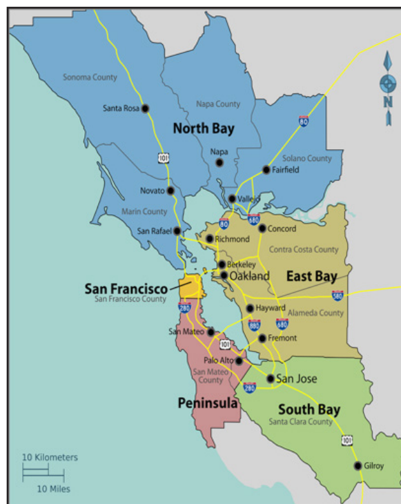
Figure 1: This regional map of the San Francisco–Oakland–San José area shows numerous local governments potentially comprising a single, human-driven or driverless ride-hailing management region with variable performance subsidies and road-use fees per local jurisdiction. Map source: Wikipedia