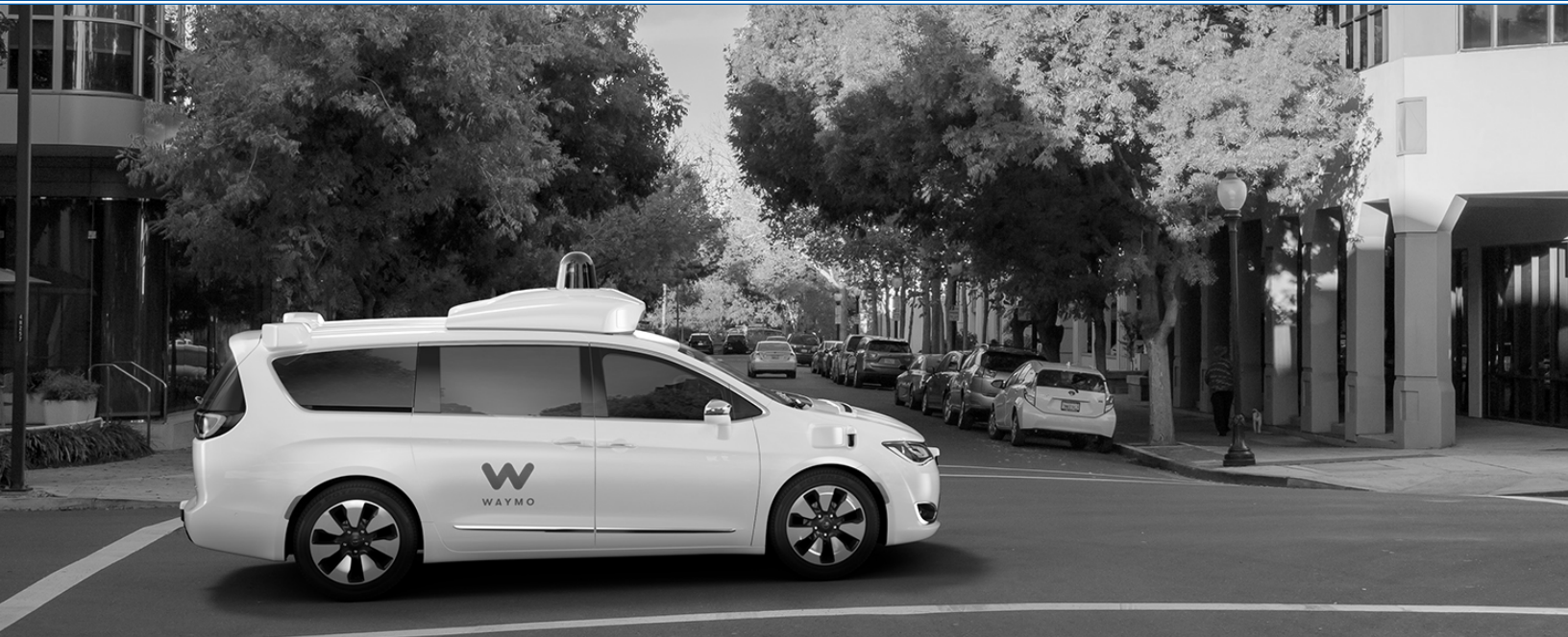
Automated For-Hire Vehicle (FHV) in a Waymo Fleet Offering Rides in a Pioneering Deployment in Chandler, Arizona