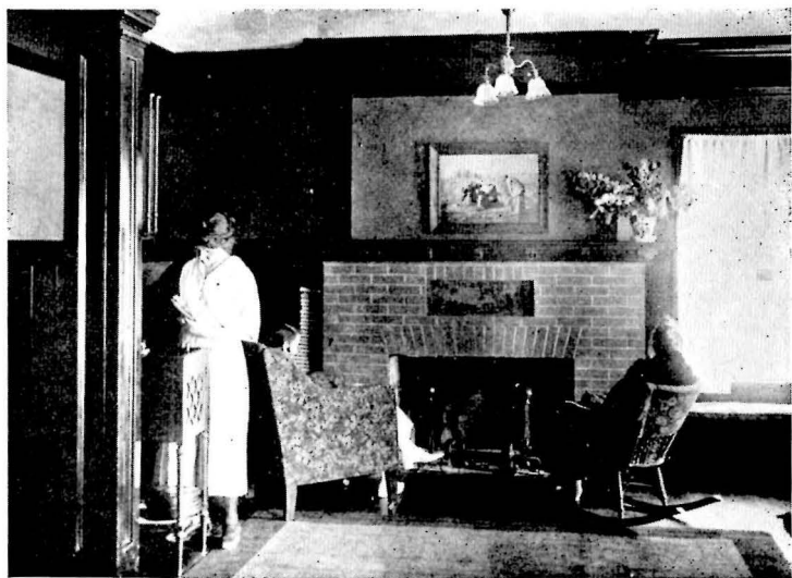
KAMOLA HALL LIVING ROOM