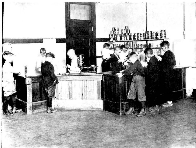
FIFTH GRADE STORE