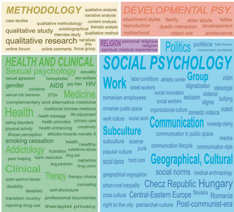
Figure 2. Thematic analysis of the keywords.

psychology (31,54%), methodology (16,1%), developmental psychology (7,38%) and religion (2,01%).