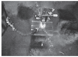
Figure 1 Operation with rectangle tool shape