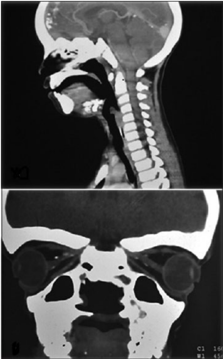
Computed tomography sagittal section of the brain (bone window) depicting calcified lymph nodes in the submental region with calcification of falx and hyperdense cortex of the flat bones of the skull, and coronal section bone window demonstrating patchy calcification of optic nerve, more prominent on the right side than left, along with areas of gyral calcification on the left more than the right hemisphere