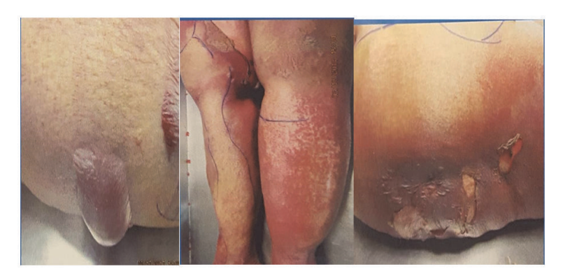
FIGURE 1: Rash on the back with bullae, rash on the posterior aspect of legs, and desquamating rash on the back.

to our hospital with left lower quadrant pain and nonbloody diarrhea and dizziness. A Computed Tomography (CT) of the abdomen and pelvis had revealed pancolitis and she was treated with antibiotics. At that time she was also found to have proteinuria, pedal edema and photosensitive rash on her face. The proteinuria was attributed to glomerular disease of unclear etiology. Autoimmune work-up revealed positive ANA, anti-Smith Ab, and anti-RNP. Parvovirus IgG was also positive. She was found to have pancytopenia and the diagnosis of aplastic anemia was considered and she was transferred to another tertiary care hospital. There, she underwent a renal biopsy that revealed focal proliferative and membranous lupus nephritis classes 3 and 5. She was discharged on prednisone, mycophenolate, and hydroxychloroquine. Now she had presented with the current complains.