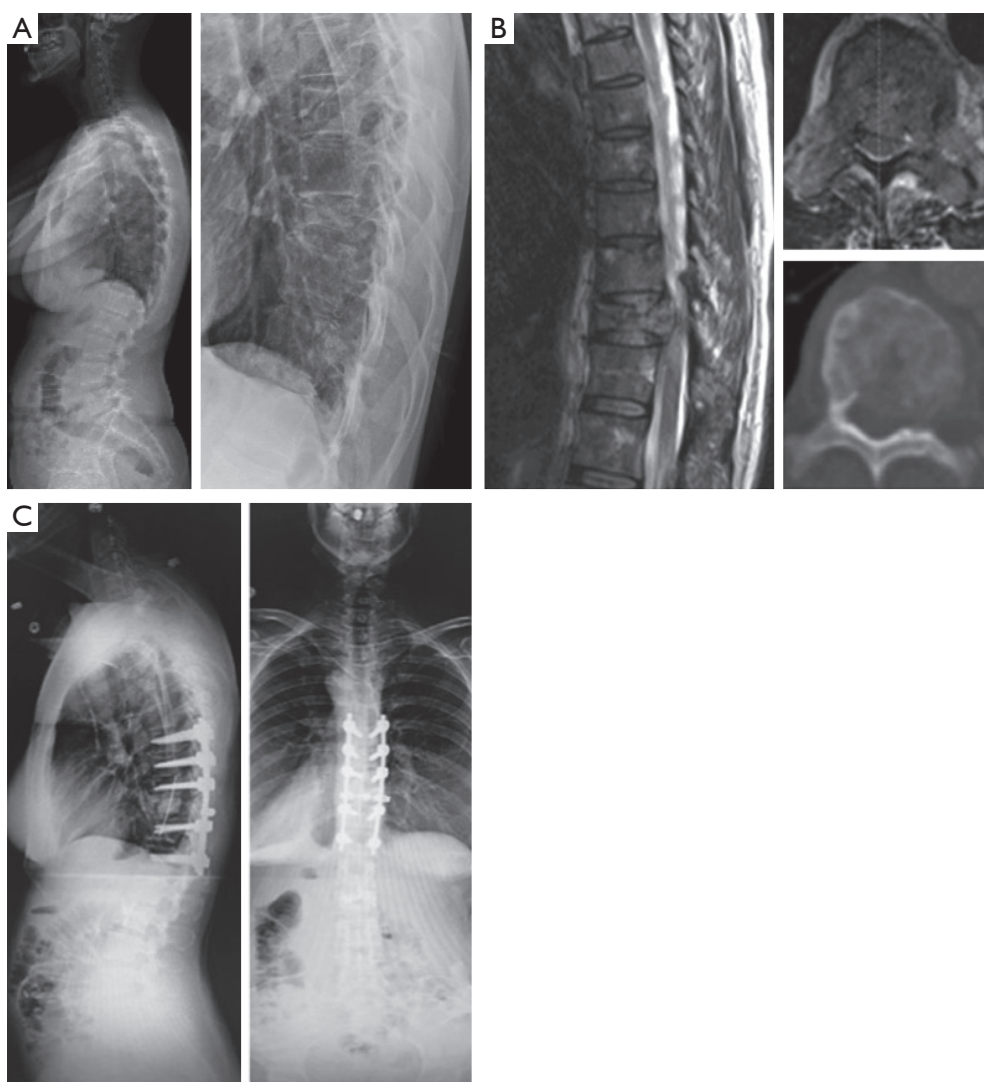
Figure 1 Preoperative full length and thoracic lateral plain films (A), sagittal T2 MRI (B, left), axial T2 MRI (B, right upper), and axial CT (B, right lower), and postoperative AP and lateral full-length plain films (C) of a 47-year-old female with metastatic breast cancer. The patient has a T10 compression fracture with cord compression resulting in mid back pain and thoracic myelopathy. Surgery was performed to decompress the spinal cord and provide stability to decrease pain.

treatment of spinal metastases. It may be used for several reasons: to address neurologic symptoms of spinal cord compression, to stabilize spinal instability, to reduce pain, to remove epidural tumor before SBRT or SRS, and to provide a histological tumor diagnosis (see Figure 1 for example) (4,6).