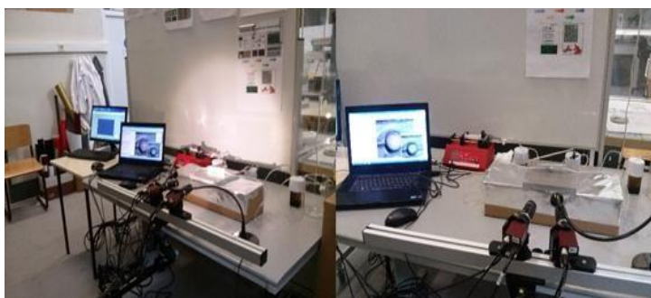
Fig.1 3D Digital Image Correlation set-up.[9]

The changes in the images can be described by the same concepts of the continuum theory which governs the deformation in small areas. In the field of experimental mechanics, this initial concept was refined and incorporated into numerical algorithms to extract from the sequence of images the value of the deformation. The digital recording of the images has been carried out with several patterns: among them: lines, grids, points and matrices. A widely used method is that which uses random pattern, comparing sub-regions along the sequence of images [64].