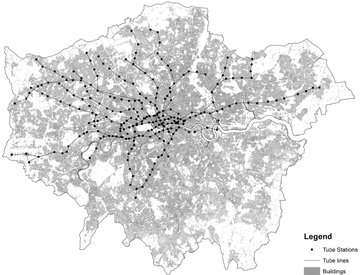
Fig. 1 Greater London Area and Tube network.