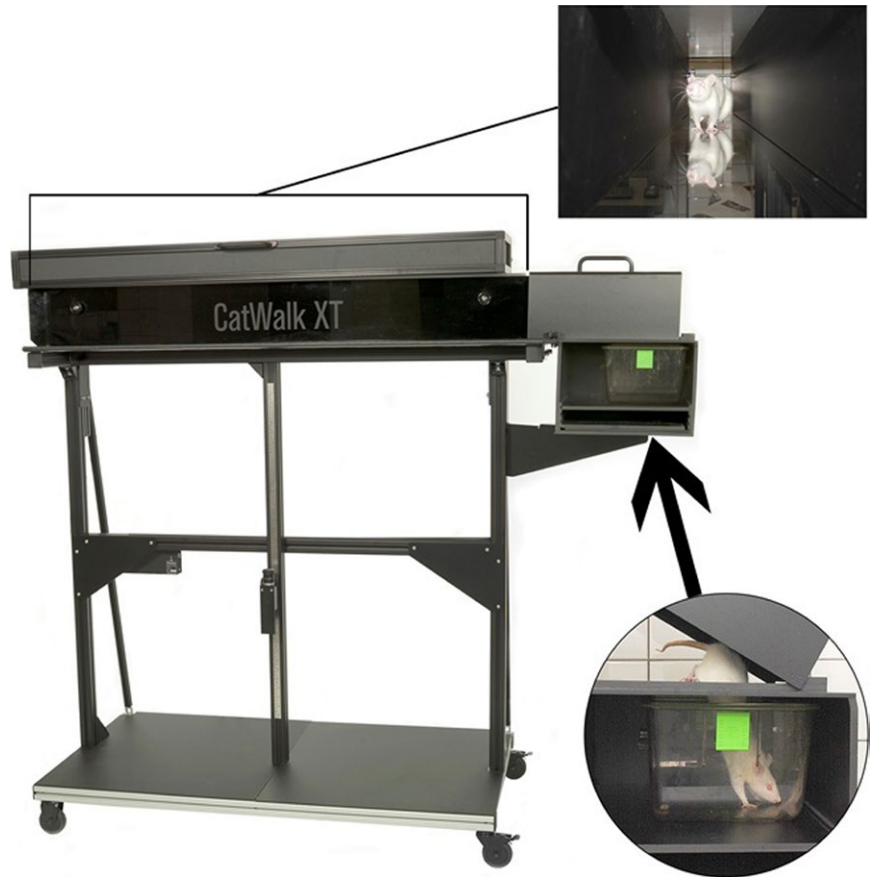
FIGURE 1 CatWalk Set Up: Animals cross the tunnel from left to right. Their footprints on the glassplate are detected by the camera below and transferred to the computer

6 mm (Figure 1). The area where a paw contacts the floor is visualized, using an optical trick. An encased fluorescent tube is put alongside the distal long edge of the glass (as seen from the observer) so that light enters the glass from the edge (Clarke, 1992; Clarke et al., 1992). Some distance away from the edge, the light is completely internally reflected in the glass (same principle as fiber optics), except in those locations where air has been replaced by another medium such as a paw; there, light leaves the glass and illuminates the paw. In this way it is only the contact area that lights up clearly. Moreover, the applied pressure is representative for the intensity of the light, enabling the walkway measuring the force used by the paws (Hamers et al., 2001; Vrinten & Hamers, 2003).