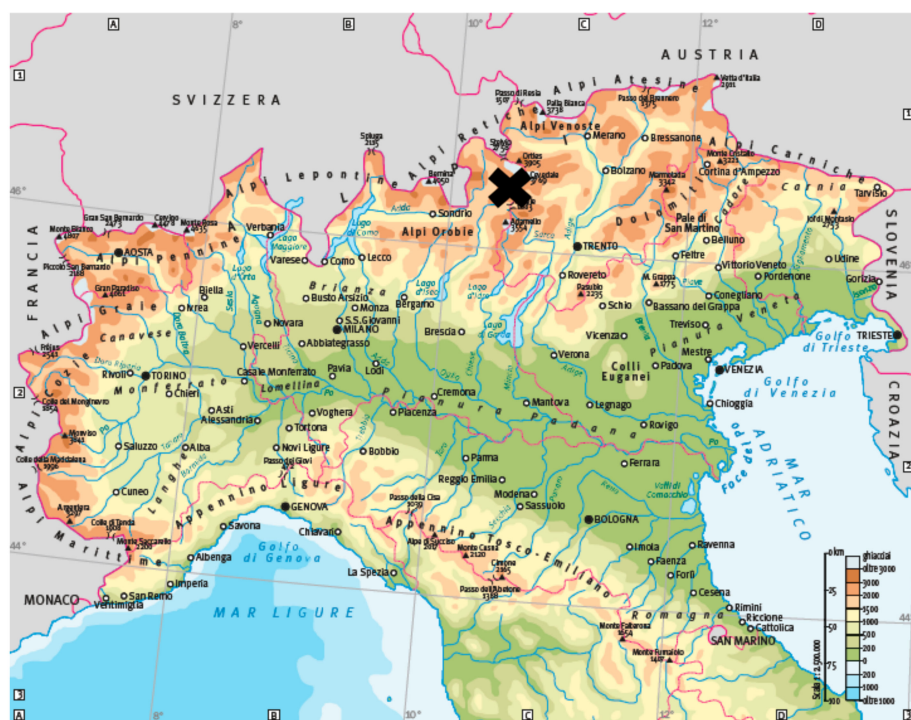
Figure 1. Position of Valfurva with respect to Italy.

The present study was performed in Valfurva, an alpine valley in the Central Italian Alps, within the Lombard sector of the Stelvio National Park (SNP) (Figure 1).