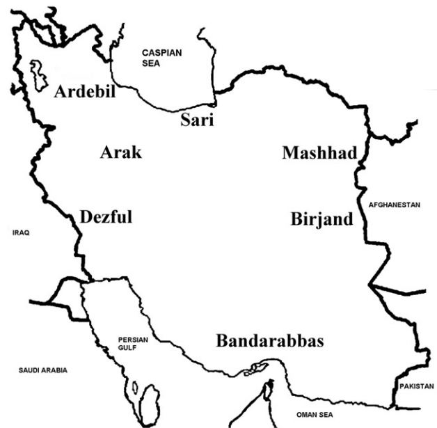
FIGURE 1. Map of Iran with geographic locations of cities selected for this study.

First, non-cycloplegic autorefraction was done by a skilled technician using the Topcon RM8800 (Topcon Corporation, Tokyo, Japan). Printed results were appended to the chart and the child proceeded to the next stage. For children with glasses, visual acuity was tested monocular and binocular with spectacle correction using the tumbling E optotype Snellen