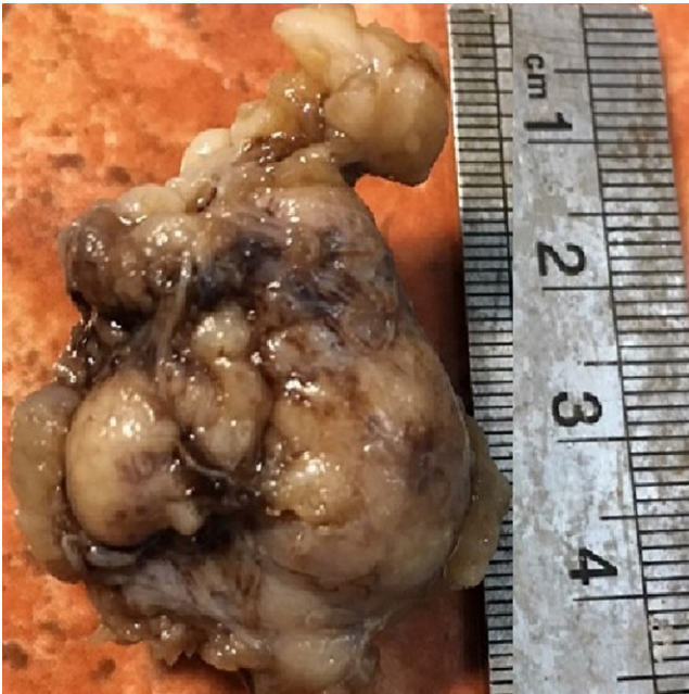
FIGURE 1 Gross photograph of resected vermiform appendix specimen showing an irregular mass adherent to the wall of Appendix

foreign body giant cell reaction have been noted on appendix wall and around the cyst also (Figure 2). Based on these findings, a diagnosis of the epidermoid cyst was made.