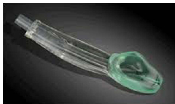
Figure 3. I-Gel

Unsuccessful placement on the third attempt was considered failure and endotracheal tube was used in such cases. Results of comparison of the success rate of airway management are listed in Table 3. The difference between the two groups in regards of insertion time and