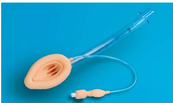
Figure 2. Laryngeal Mask Airway