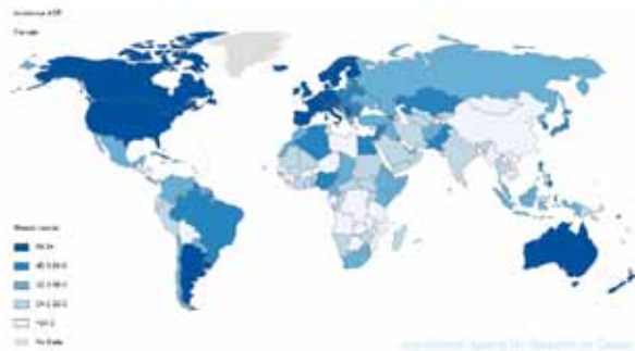
Map 1. Distribution of the Standardized Incidence Rate of Breast Cancer in World in 2012 (extracted from Globocan 2012)