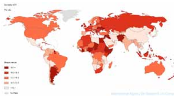
Map 2. Distribution of Standardized Breast Cancer Mortality Rates in World in 2012 (extracted from Globocan 2012)