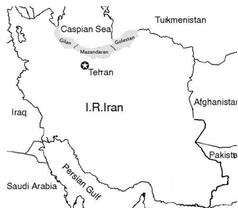
Figure1: Geographic situation of Gilan, Mazandaran and Golestan, Iran

(figure1). Data were collected retrospectively by reviewing all medical records of cancer patients registered in Cancer Registry Center of health deputy for Gilan, Mazandaran and Golestan provinces during a 6-year period (2004-2009) (23). The date of diagnosis was confirmed coded and was based on the International Classification of Diseases for Oncology (ICD-O).