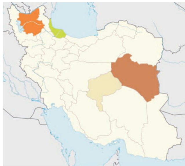
Figure 1. The areas of study including East Azerbaijan, Gilan, Yazd and South Khorasan Provinces marked on the map of Iran as orange, green, cream and brown respectively.

hot and dry climate in sand dunes region) and East Azerbaijan Provinces (cool and dry climate in mountainous region) in Iran (Figure 1). The sampling period commenced in January 2011 and ended in December 2011. Sampling was undertaken in different types of livestock found in stables situated in randomly chosen villages.