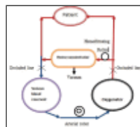
Figure 1 MUF circuit

Hemodynamic variables (systolic blood pressure, diastolic blood pressure, mean blood pressure, heart rate, and central venous pressure) were measured before anesthesia induction (baseline), the start of bypass pump, the end of bypass pump, 15 min after bypass pump (end of MUF), the time entering the Intensive Care Unit (ICU), and 2, 4, 6, 8, 10, 12, 24, and 48 h after the surgery. Comparison between patients who received MUF + CUF and those who received CUF was conducted with respect to the duration of mechanical ventilator support, duration of ICU stay, and duration of hospitalization. Total number and dose of inotropes during stay in the ICU were calculated by the doses of 5–10 µg/kg/min for dopamine, 5–7 µg/kg/min for dobutamine, 0.05–0.15 µg/kg/min for epinephrine, and 0.5–0.75 µg/kg/min for milrinone.[15] We use an institutional protocol for vasoactive drug usage as: epinephrine 0.01–0.15 µ/kg for SBP <65 mmHg for neonates, SBP <70 for infants (1 <age <18 month), and SPB <75 for children >18 months).