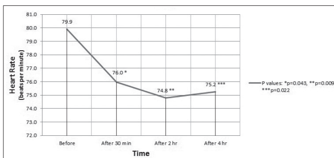
Figure 3. Heart rate (mean) of the participants during the test. Analysis by repeated measures ANOVA

demonstrated a significant HR decline with time (p=0.043, p=0.009, and p=0.022 for 30 min, 2 h, and 4 h post-consumption, respectively). Figure 3 summarizes the data related to the sequential HR measurements.