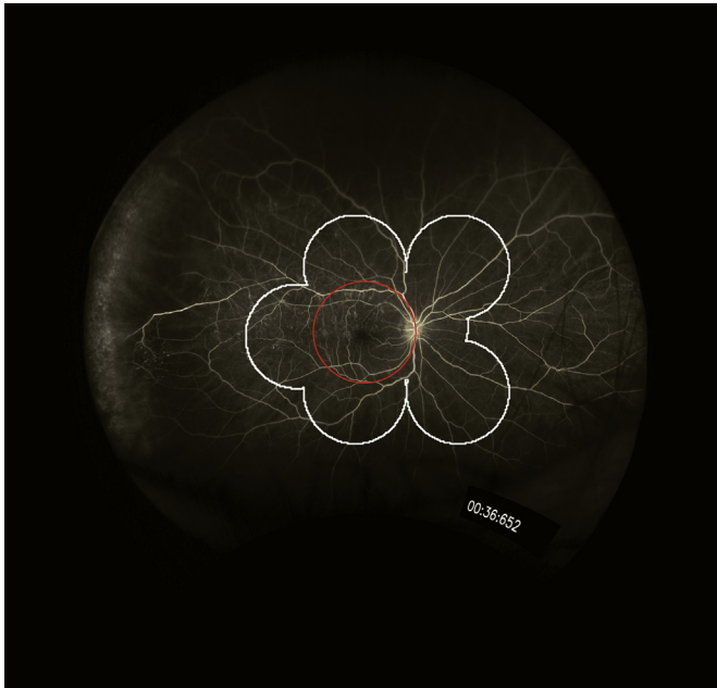
Fig. 1. Central/axial ultra-wide-field fluorescein angiography image obtained with Optos instrument from a patient with superotemporal branch retinal vein occlusion. Red circle shows a 30° image centered on the macula, the white line delineates the field covered by a montage of 7 field ETDRS image. With a central 30° and 7 field montage image, the areas of non-perfusion in the temporal periphery remain undetected.

photography as a screening tool for diabetic retinopathy to identify patients with retinopathy for referral for ophthalmic evaluation and management. 1 Non-mydriatic retinal photographs have been shown to allow easy, reliable and reproducible imaging of the optic nerve and retina in non-ophthalmologic settings such as the emergency department. 2