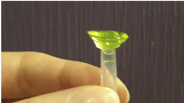
Fig. 2. Hybrid lens over the plunger and filled with fluorescein.

ophthalmologists to receive contact lenses. The descriptive statistics of the study patients is shown in Table 3.