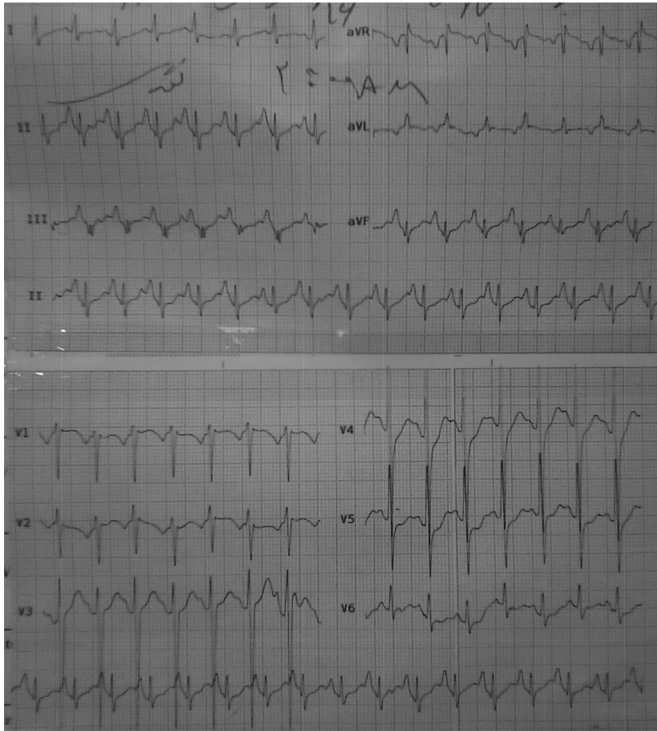
Fig. 2. One of patients ECG demonstrating sinus tachycardia and QT prolongation (Corrected QT is about 0.50 msec).