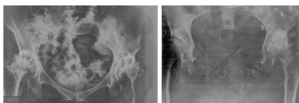
Figure 1. Left: X-Ray Before Laser Therapy, Right: X-Ray After Laser Therapy.

This case of FHAVN improved significantly after a prolonged course of laser acupuncture. However, in some orthopedic sources, noninvasive treatments like inhalation of hyperbaric oxygen, mesenchymal stromal cell therapy, gene therapy carrying growth factor, and vascular endothelial growth factor 20,21 have been mentioned, but to the best of our knowledge, it is the first report using low-level laser therapy as a treatment for AVN of the femoral head. It seems that this study has been able to show the effect of LLLT on AVN treatment, for the first time. In addition to pain control, results showed that the destruction of the femoral head was stopped and bone lesion severity on the right and left moved from Stage V, VI to IIC and IIB, respectively (based on University of Pennsylvania classification) and pain scores at break time and during routine activities were 0.