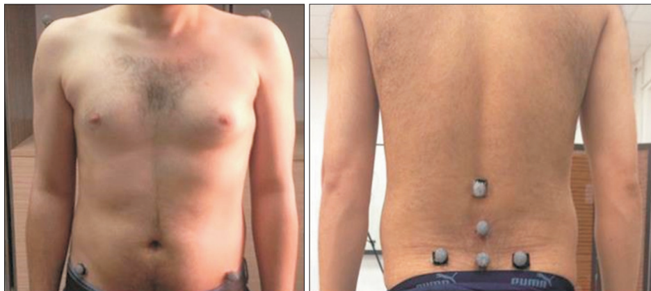
Fig. 1. Marker set up.

The following standardized marker locations were used [21]: T_{12} was first located and marked using the technique suggested in Gray's Anatomy for Students [28]. The spinous process of T_{12} was identified while participants were in a flexed standing position supporting themselves on a stool. Marker location was confirmed by counting spinous processes from T_{12} down to the S_2 spinous process. It was then double checked by counting back up to the marked spinous process (Fig. 1). Three markers were placed on the spinous process of T_{12} , L_3 , and S_2 . Two markers were placed on acromioclavicular (AC) joints. Four markers were placed on bilateral anterior superior iliac spines (ASIS) and posterior superior iliac spines (PSIS). To detect gait cycle during walking trials, four markers were placed on the posterior calcaneal tubercle (posterior heel center) and the 5th metatarsophalangeal joint of both feet [2]. A physiotherapist who was a Ph.D. student in physiotherapy performed all marker placements in two sessions. Participants were asked to return for retest after 6–11 days following their initial visits [24]. This time interval was long enough to avoid assessor memory bias yet short enough to avoid change in gait pattern and clinical condition of CLBP patients [16]. Both tests were conducted at the same time between 9 and 12 o'clock of the morning to reduce the effect of diurnal variation in joint mechanics. All procedures were carried out by the same assessor.