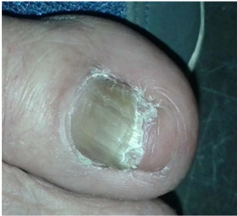
Fig. 1. Distal subungual thickening and hyperkeratosis of patient.