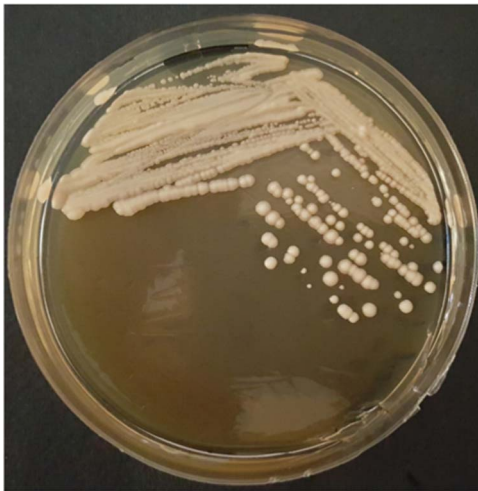
Fig. 2. Creamy and smooth colonies of Cr. friedmannii on sabourauds dextrose agar plate with chloramphenicol.