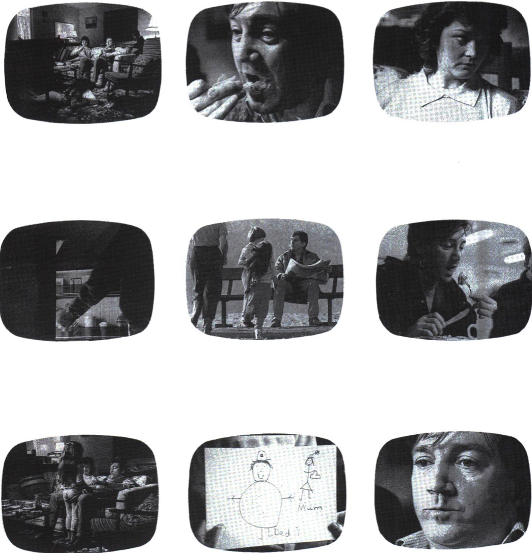
Figure 3: Stills from “Stop” television advertisement, 1988 97

The advert was initially screened over the New Year period between 1988 and 1989, which was thought good timing, and not just for the festive season’s apparently favourable advertising rates: ‘a very appropriate time to advertise,