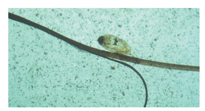
Fig. 2. A nit on an eyelash.

Pthiriasis of the eyelashes usually occurs in both eyelids, although cases with involvement of 1 eye have been reported (5). The eyebrows are rarely involved. This pthiriasis is