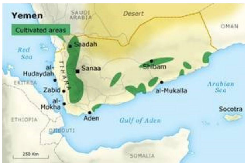
Figure 3: Agricultural regions of Yemen