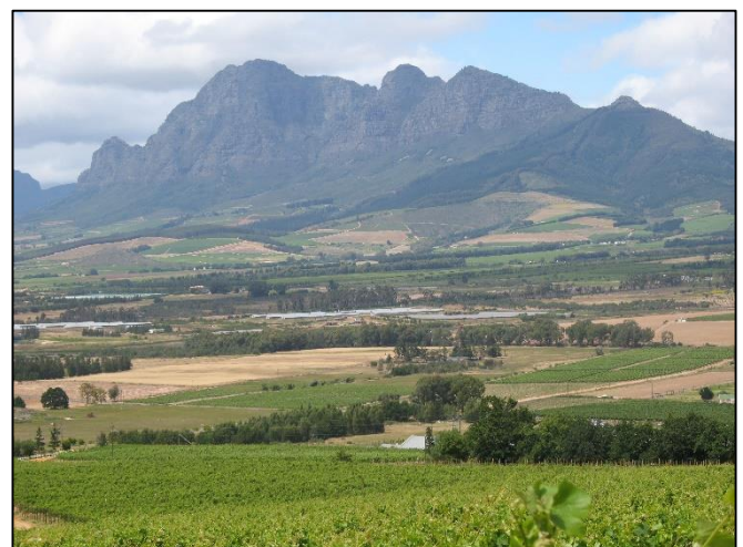
Figure 2. Agroforestry in South Africa is often dominated by eucalypts and even Mediterranean pines ( Pinus pinaster ), where cultivated lands (here viticulture) are surrounded by forested areas of different sizes.

In agroforestry systems the requirement of fast growth is slightly less important than in SRC systems and this allows a greater diversity of trees and the non-woody components. This is particularly important regarding the functions of agroforestry and the possibilities to create new habitats and maintain or increase the biodiversity of agroecosystems. Using indigenous trees with high-value products in agroforestry systems enhances profitability, particularly those that can be marketed as ingredients of several finished products. In certain countries, the use of indigenous tree species is difficult, since their growth is far behind the growth of some exotic genera, such as Eucalyptus , which is extensively planted in Southern Europe and South Africa (Figure 2).