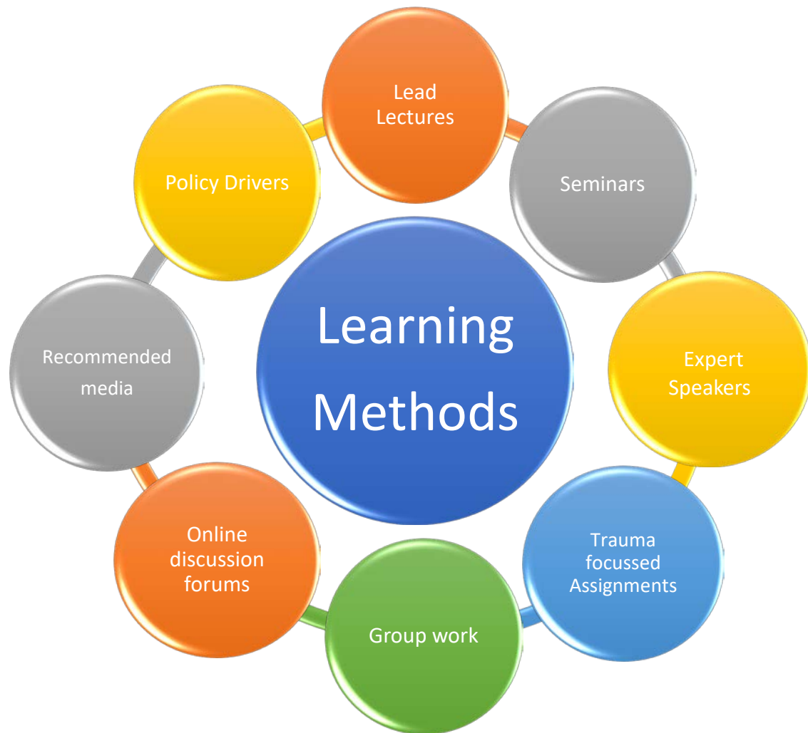
Figure 1: Blending Learning Model: Delivery of Trauma informed Curriculum