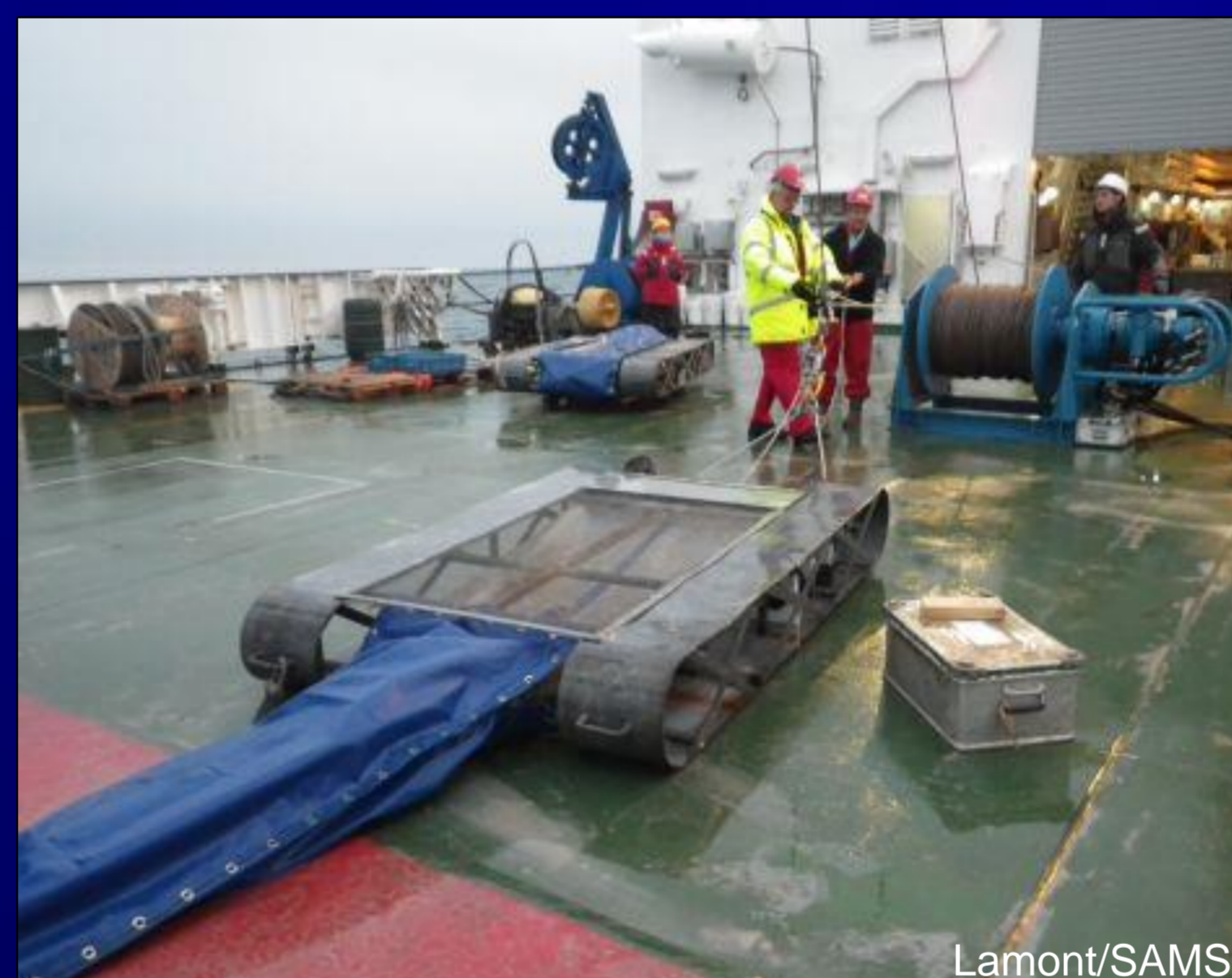
Epibenthic sled with net trailing behind on deck of research vessel, used to collect deep-sea fauna samples