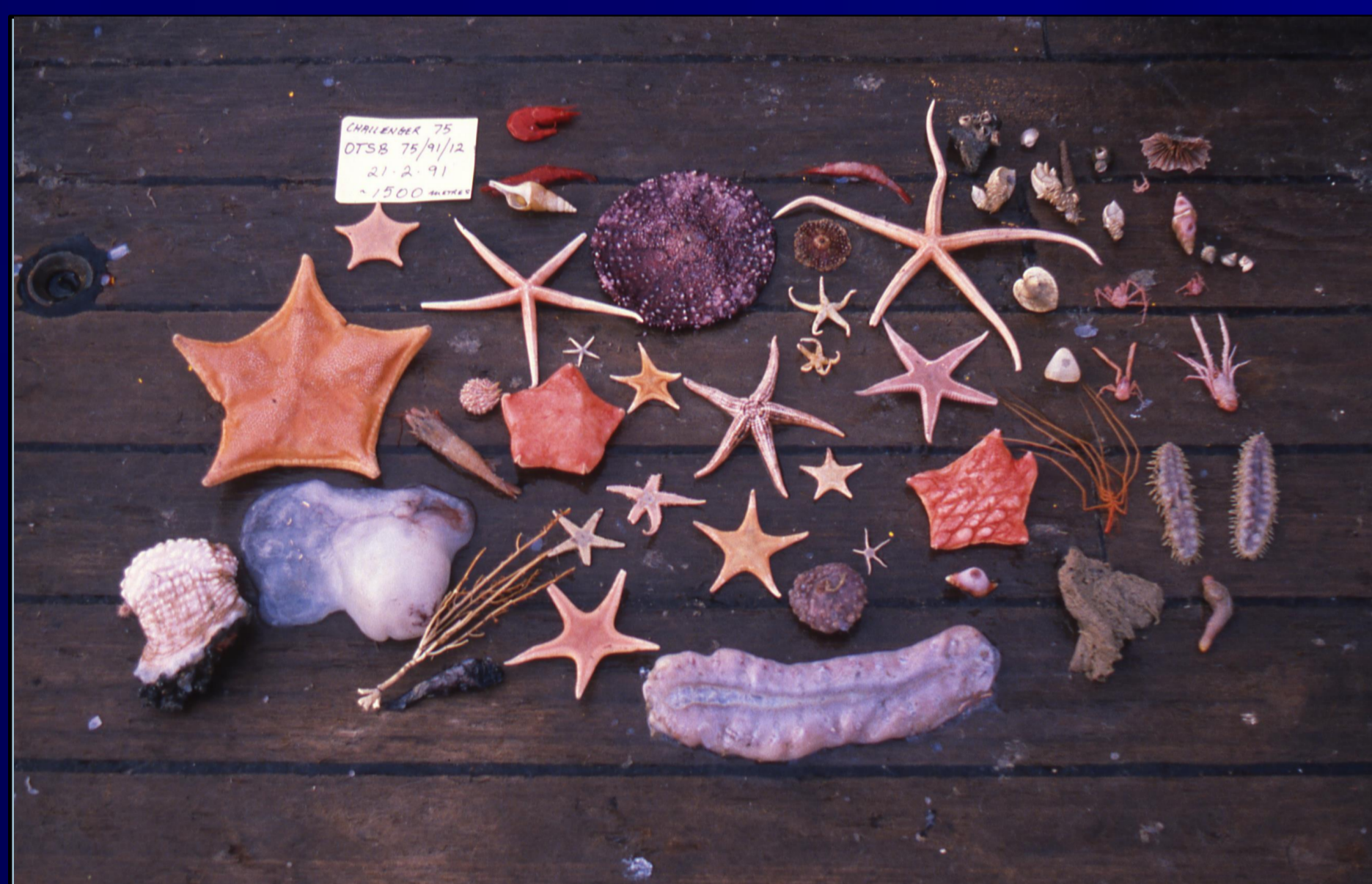
Example of the diversity of deep-sea benthic macrofauna obtained from one trawl from the Rockall Trough, ~2200m deep