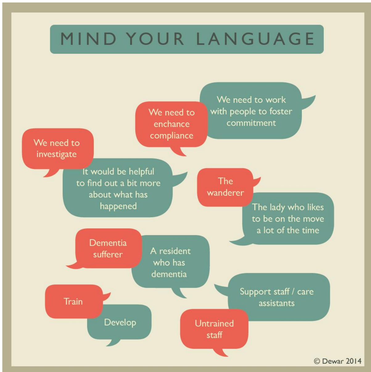
Fig. 2: Mind your language poster

Staff displayed their language poster for all to see and learn from - in itself a courageous act, as it openly stated to staff, relatives and residents, where they had perhaps used less person-centred language in the past.