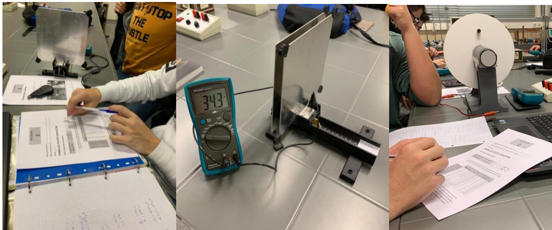
Figure 1. Practice of Physics Laboratory: Parallel-Plate Capacitor, without rubric

For this reason, we have decided to continue with the design and implementation of rubrics, now, with this laboratory practice that has been developed by the students without the help of rubrics (figure 1), but that will also be developed with the use of the rubric to know its effectiveness.