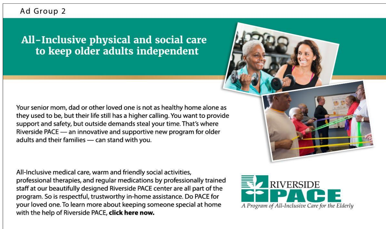
Figure 5. PACE ad, Group 2. Screenshot.

Per Readability Formulas, the SMOG grade level registered at 9.8 or 10th grade. The phrase, “but their life still has a higher calling” reflects the element “affirmation of a person’s and/or community’s spirituality/connectedness to God or a Higher Power.” The clause “You want to provide support and safety” reflects the element of community responsibility. The phrase “outside demands steal your time” acknowledges the element of an unjust outside force that is responsible for the health problem and beyond one’s immediate control to solve. Again, this is the key distinction of the African American jeremiad from the American jeremiad. It identifies the additional burden Black Americans must bear to strive to overcome an intentionally oppressive racist system, a burden that is too often unacknowledged. Finally, the sentence, “Do PACE for your loved one” reflects the element of optimism and taking “personal responsibility” to address the problem. The changes were strategically done at the beginning of the passage to immediately make an intimate personal connection with the audience. The goal was to draw the audience in by identifying their problem but in a way that resonates culturally. The middle or