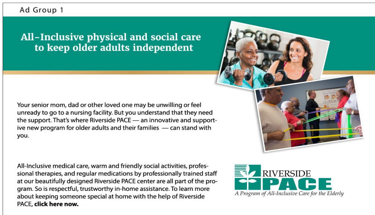
Figure 4. PACE ad, Group 1. Screenshot.

Readability Formulas, a free, online readability tool, was used because it provides results from a variety of tools, including the SMOG Index, which is widely used for healthcare communications. The SMOG grade level for the Version 1 text was 10.8 or 11th grade. This grade level was obviously higher than the PL target of 8th grade but acceptable for an online audience, which skews toward a college-educated level. Per PL recommendations, the sentences were shortened and to include only one idea per sentence. However, a concern was to not stray too far from content and cadence of the original language of the approved print ad. Doing so could introduce language that might minimize the distinction from the jeremiad version. Nonetheless, the fourth sentence of the passage could have been divided into two shorter sentences. Rather than three paragraphs, the text was also presented in two blocks, which were easier to process.