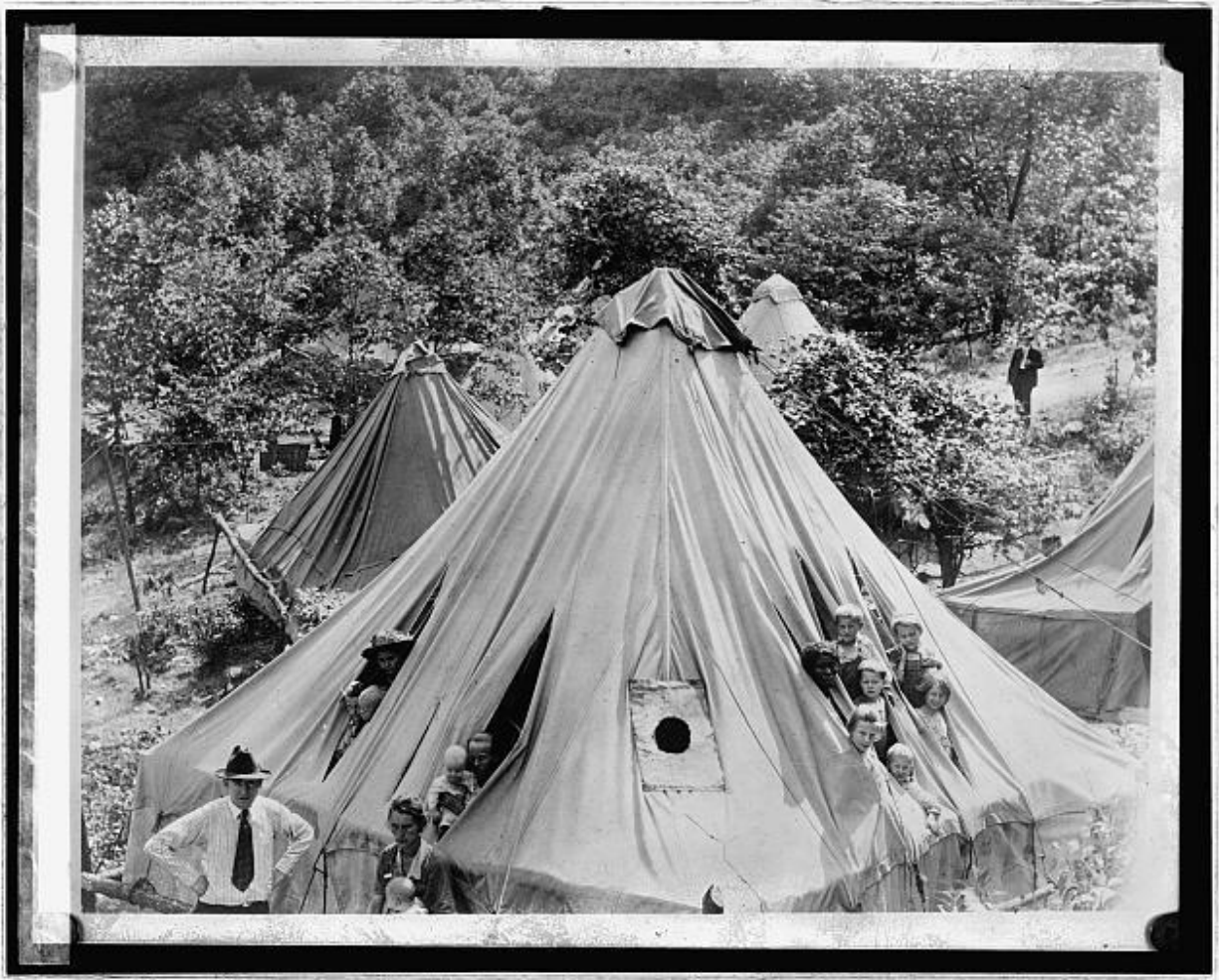
Figure 5. "Tents, Lick Creek, WV, April 12, 1922."