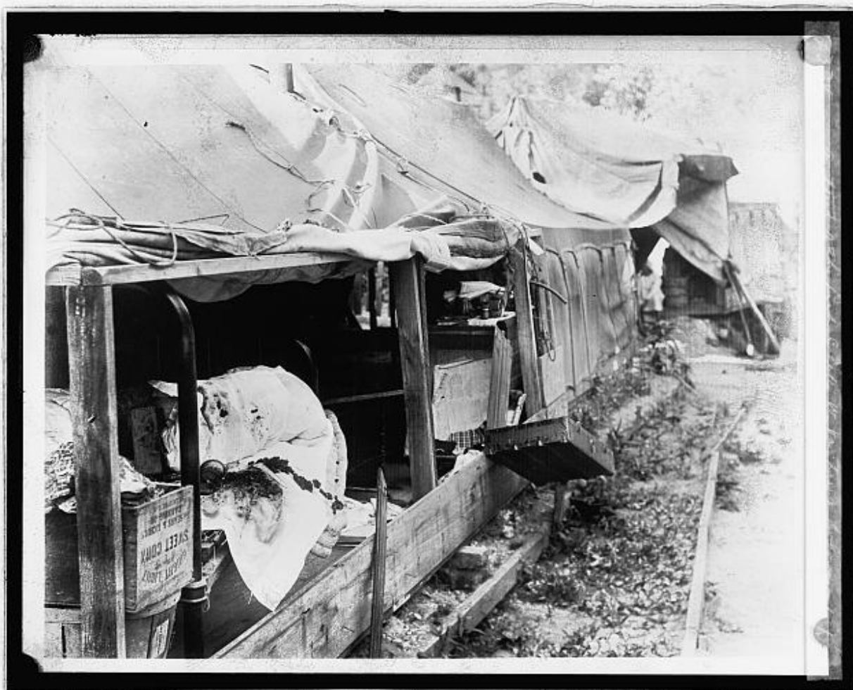
Figure 6. A tent of the Lick Creek, WV, tent colony, April 12, 1922.