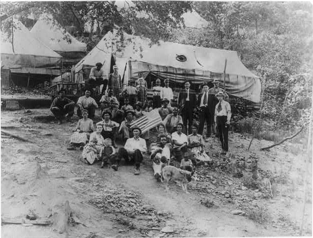
Group of striking Union Miners in the Lick Creek District of West Virginia. #737v 4/12/22