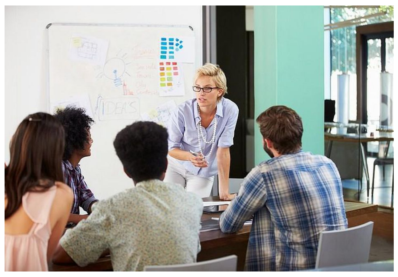
"The key skill of organisational catalysts is the ability to build links between different sets of groups of friends..."

All organisations rely on effective team and group work for their success. But teamwork doesn't just happen. Groups of individuals need to be brought together an held together, working in concert for a common aim.