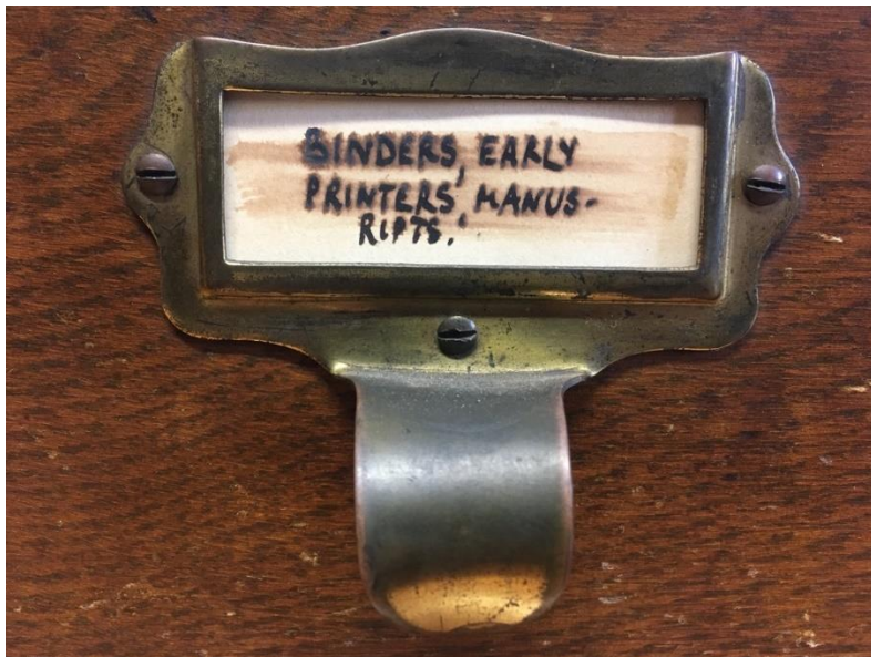
Fig. 1: Loose card drawer labelled 'Binders, Early Printers, Manuscripts'

between 1949 (the latest article to appear without a manuscript number) 52 and 1956 (the earliest study published with a manuscript number). 53