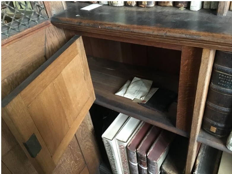
Fig. 7: Bay XVIII's lockable cupboard containing envelopes with clasps